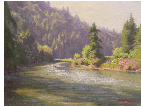
"Summer on the Yaquina" oil 12" x 16"