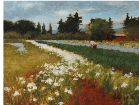
"Weeding" oil 12" x 16"